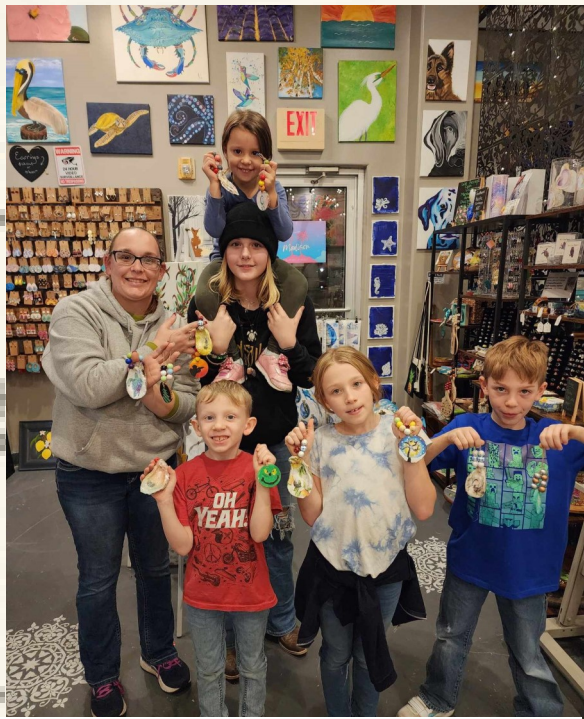
CJ brought the kids in to make Christmas ornaments! They all did such a nice job, and might I add how well-behaved they all were! I'm sure Santa was very good to them!