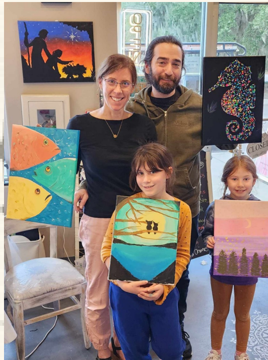
The Cook's were here from Maine visiting family and decided to take in some art!